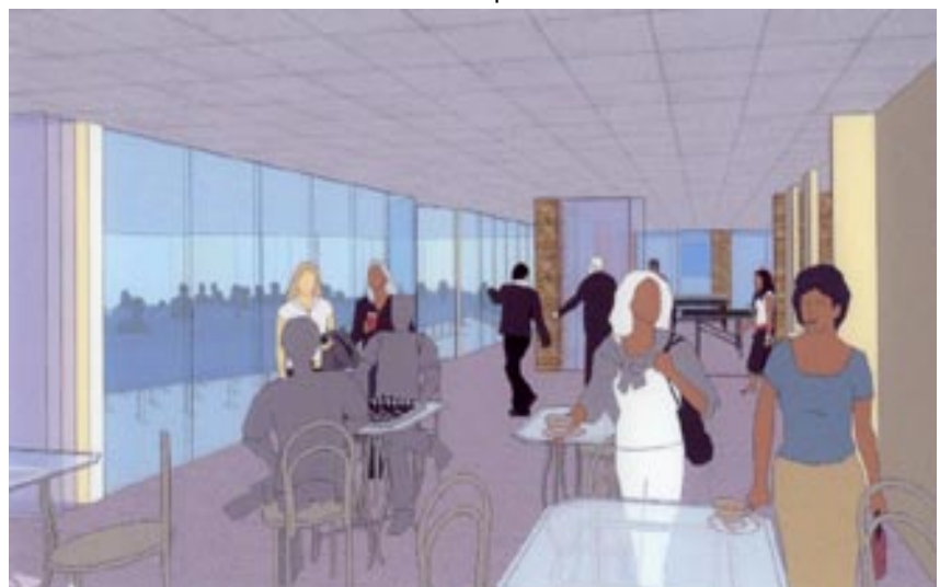
View into new sunroom/lounge space.