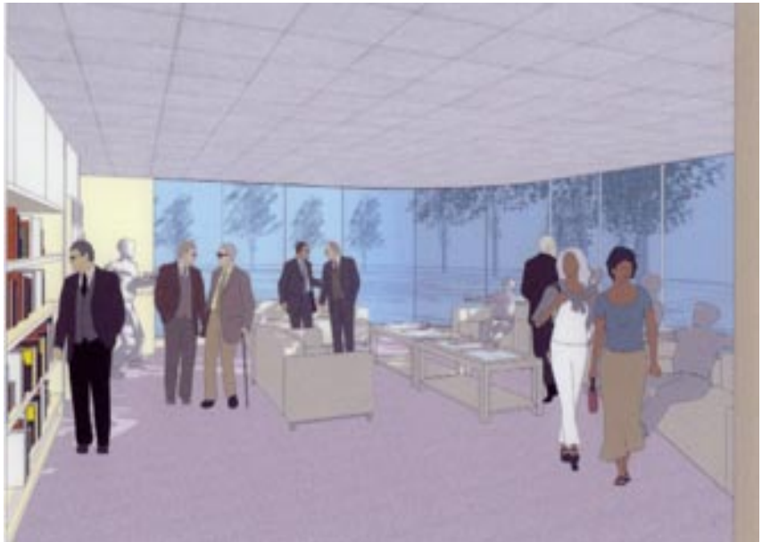
If the club's ambitious three-stage development wins support from the ACT Government, this is what it may well look like. Above, the view from an enlarged dining room space.

The club will argue that governments have a responsibility to older citizens, just as they have in education, health and other areas. A government may well consider it less expensive to build on the existing foundation provided by the Woden Senior Citizens' Club and similar clubs in the ACT than it would to put into place a new, government-initiated facility.