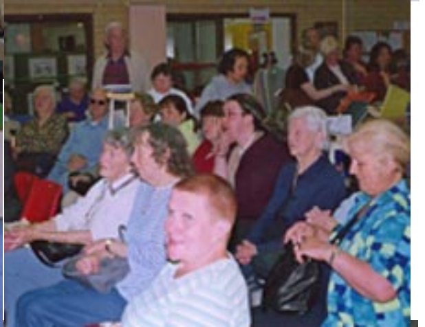
Annual Fete: Despite occasional heavy showers (bottom right), the club's annual fete proved a great success. ACT Chief Minister John Stanhope (centre) opened the fete, praising the club's initiative, and describing the club as a model for others in the ACT. Other photos are of stallholders, members of the audience, ladies preparing refreshments, members of the artists group, and the "raffle wheel".